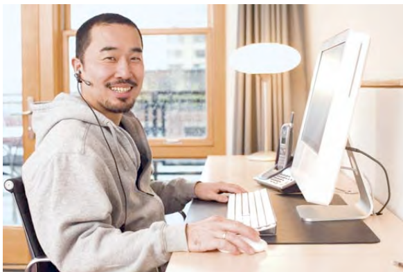
Image source: "Participants at social networking sites do more than just type messages: they often share ...." Online Photograph. Encyclopædia Britannica Online School Edition. 25 May 2009 < http://school.eb.com/eb/art-120690 >.

Introduction: Social network sites are great places to make friends, share ideas and experiences, and project an image of yourself. Are you the same person face-to-face and online? Are you making wise choices when meeting people online? To illustrate how important your online image is, you may want to know that many employers access social network sites such as MySpace and Facebook to complete background checks on job applicants. In many cases, applicants have some difficult things to explain when questioned about the content on their personal pages. Even embarrassing photos and words that you thought you deleted long ago are still archived somewhere and may be used by someone else without your permission. On the other hand, knowing how to interact safely and appropriately when meeting people online is crucial. Are you a responsible social network citizen?