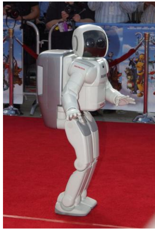
"Robots World Premiere."

Introduction: Display selected inventions on a timeline. To build interest, you may want to remove the dates and have students predict when the items were invented. To locate dates of inventions, visit Compton's Encyclopedia and click the Timelines link (Technology).- http://school.eb.com/timelines-ebi/eb_us_nn.html